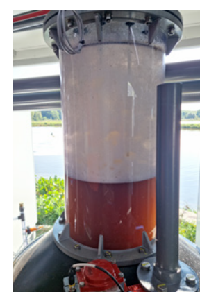
Figure 3: Photo taken during the second fractionation step in a full-scale plant. The dry foam can be seen being removed by vacuum.

In the third fractionation step, which is performed in the same way as step 2, further concentration increases are obtained. The total increase in concentration obtained over the three steps is between 50,000 - 2,000,000 times initial concentrations in the untreated water. The hyperconcentrate waste volumes are therefore this same