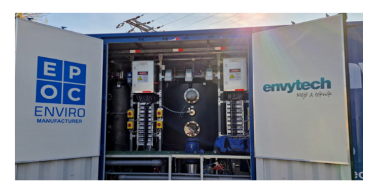
Figure 1: Photo of a SAFF40 treatment plant

The SAFF system works by accumulating the PFAS compounds at the top of the first treatment column where the first fractionation step takes place. When air is injected at the bottom of the column and rises in a created vortex, the PFASs attach to the bubbles and flow with them to the surface. Foam and water flow over a "weir design" at the top of the column (see figure 2) and therefore called "the wet cut", as both the created foam and the underlying water are removed. This underlying water is removed as PFAS stratifies at the top of the column as the shorter chain PFAS do not have the same foam potential as the longer chains.